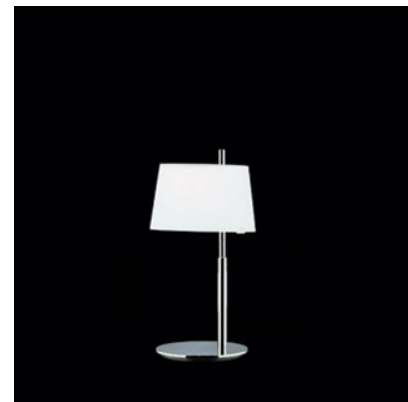
Table lamp with dimmer. Chrome-plated (CR) or brushed nickel-plated (NC) brass frame. Diffuser of white satin blown glass with metal upper reflector.