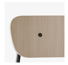
Lacquered oak with black fitting