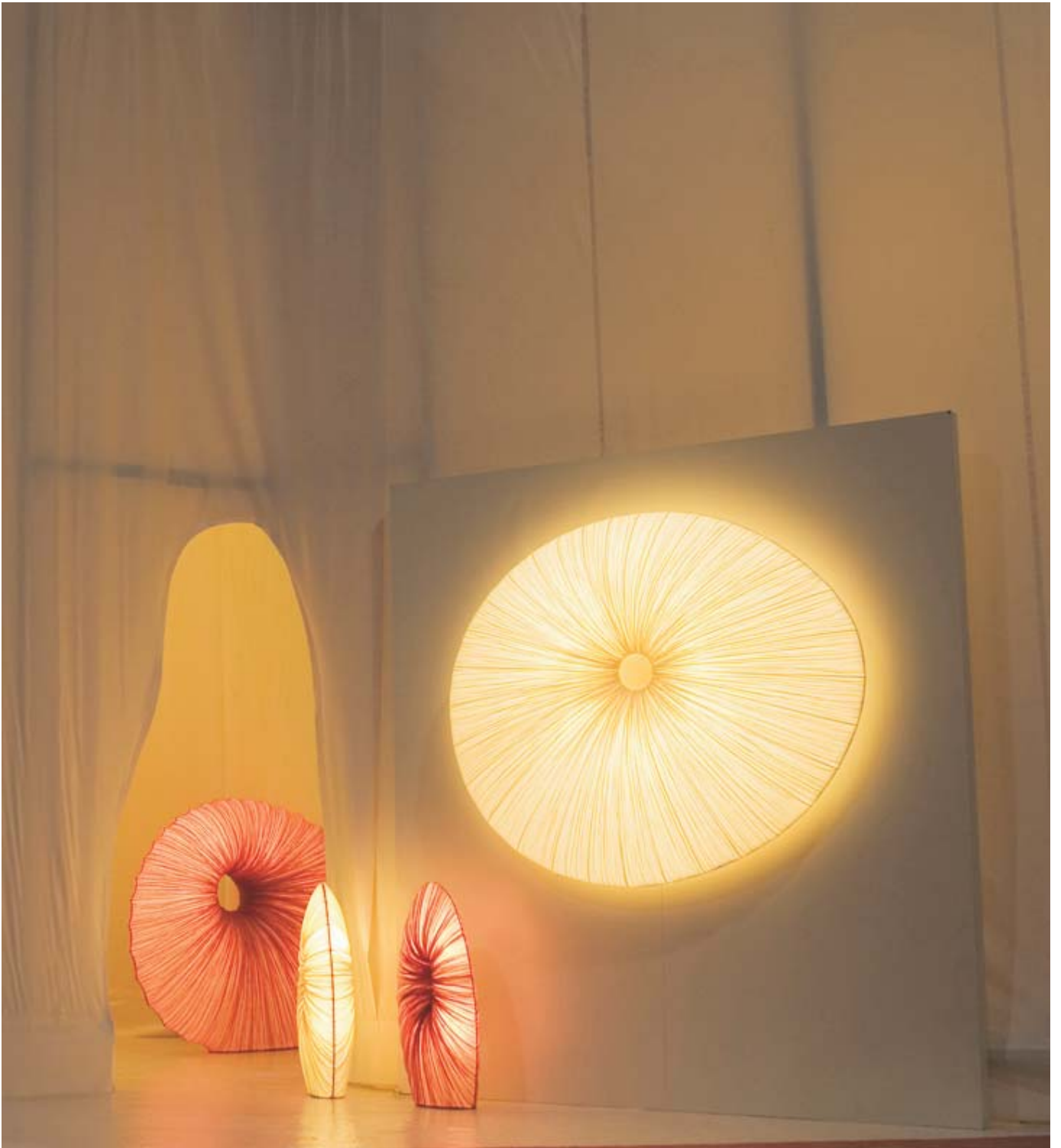
Sahara Wall (Gold)