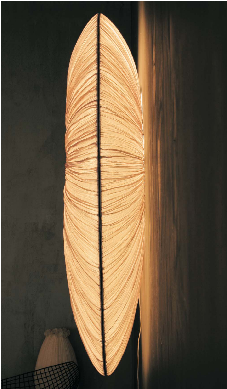
Sahara Wall (Cream)