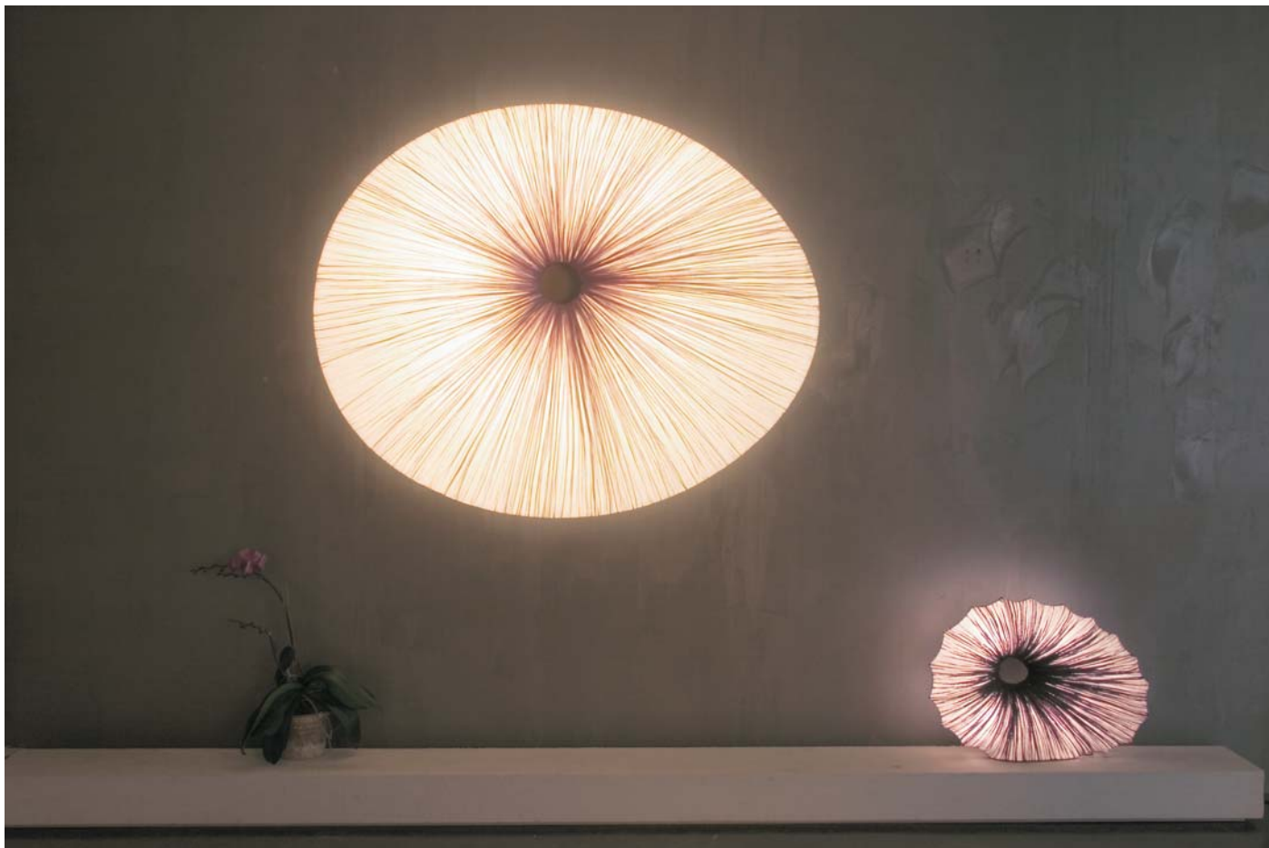
Sahara Wall (Cream)