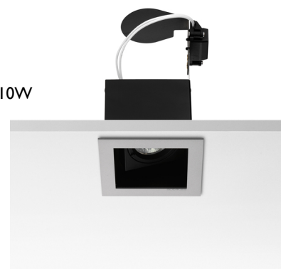
Micro Battery Adjustable designed by F.A. Porsche

12V halogen lamp recessed downlight. Remote transformer not included