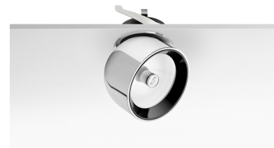
Wan Spot designed by Johanna Grawunder

Spotlight to be installed recessed on ceiling/wall. Remote transformer not included.