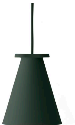
Dark Green 1400499