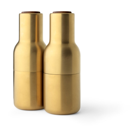
Brushed Brass 4415839