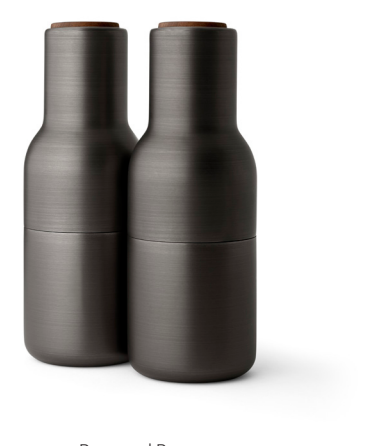
Bronzed Brass 4415859