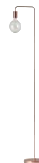
Glossy copper: art.no. 103833