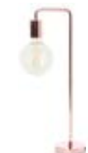
Glossy copper: art.no. 100809