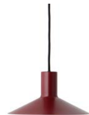
Matt wine red: art.no. 108376 MADE TO ORDER (4 WEEKS)