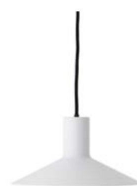
Matt white: art.no. 108373