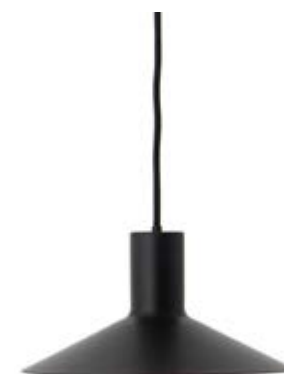
Matt black: art.no. 108372