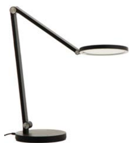
Matt black: art.no. 101395