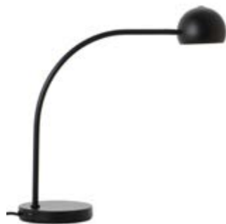
Matt black: art.no. 101477