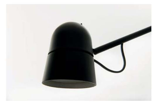
(*) The LED lamps cannot be changed in the luminaire