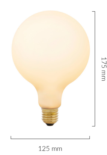
BEST PAIRED WITH

Glare control: We use up to 8 LED filaments in our lamps. This, together with a thicker phosphor coating, reduces and controls glare, resulting in an even, more comfortable light.