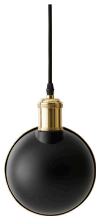
Black / Brass 1940539