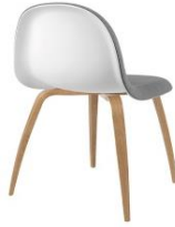
// White Cloud