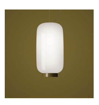
Chouchin Reverse 2