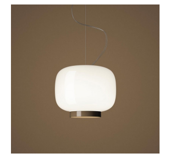
Chouchin Reverse 3