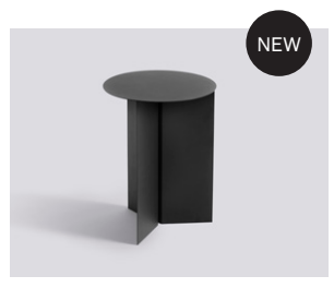
HIGH / Ø35 x H47 CM Black / White / Light yellow