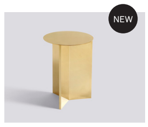
HIGH / Ø35 x H47 CM Brass / Mirror