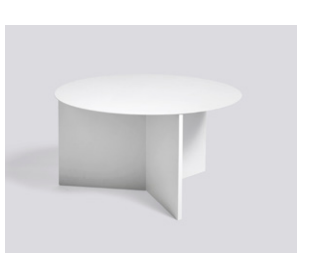
XL / Ø65 x H35,5 CM Black / Brass / Mirror / White