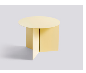
ROUND / Ø45 x H35,5 CM Black / Brass / Mirror / White / Light yellow