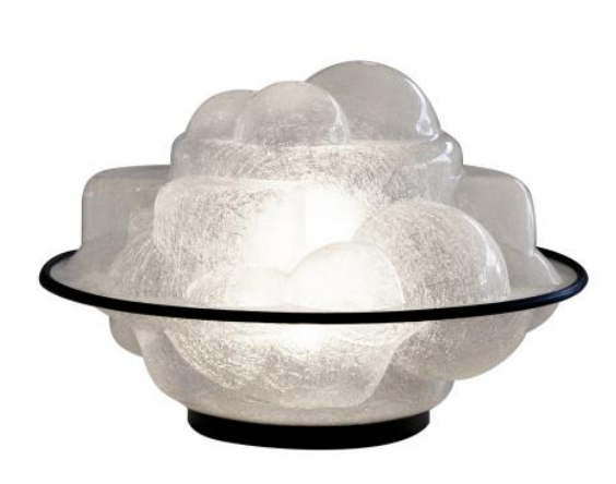
TABLE OR FLOOR LAMP WITH DIFFUSED LIGHT. DIFFUSER MADE OF TRANSPARENT METHACRYLATE AND POLYESTER RESIN WITH FIBRE-GLASS CRYSTAL COLOR. CONNECTING RING IN BLACK RUBBER, BLACK LACQUERED ALUMINIUM BASE.REISSUE OF 1968.