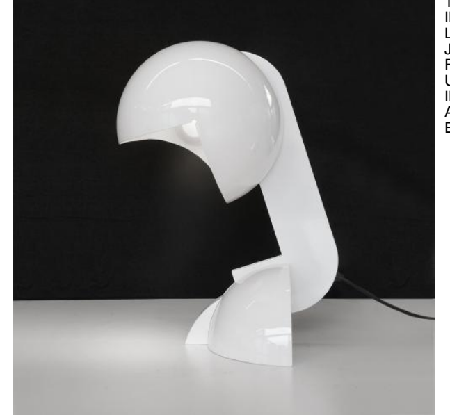
TABLE LAMP WITH DIRECT AND INDIRECT LIGHT, IN WHITE LACQUERED METAL, THE ARM IS JOINTED ON THE BASE, TWO REFLECTORS TURN AROUND THE UPPER PART OF THE ARM EACH ONE INDEPENDENTLY FROM THE OTHER. AVAILABLE WITH FOUR ARMS AND EIGHT REFLECTORS VERSION.