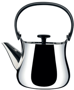
NF01 - Cha Design Naoto Fukasawa, 2014 Kettle/teapot in 18/10 stainless. cl 90 - cm 19 x cm 14,3 - h cm 22