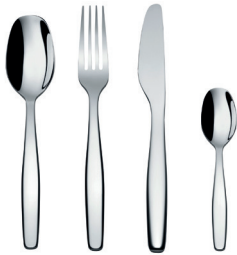
ANF06S24 - Itsumo Design Naoto Fukasawa, 2019 Cutlery set composed of six table spoons, six table forks, six table knives, six coffee spoons in 18/10 stainless steel.