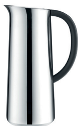
NF05 - Nomu Design Naoto Fukasawa, 2017 Double wall thermo insulated jug in 18/10 stainless steel and thermoplastic resin. cl 100 - cm 17 x cm 11,7 - h cm 29