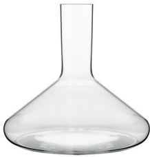
NF09/4000 - Eugenia Design Naoto Fukasawa, 2024 Decanter in crystalline glass. cl 75 - h cm 21