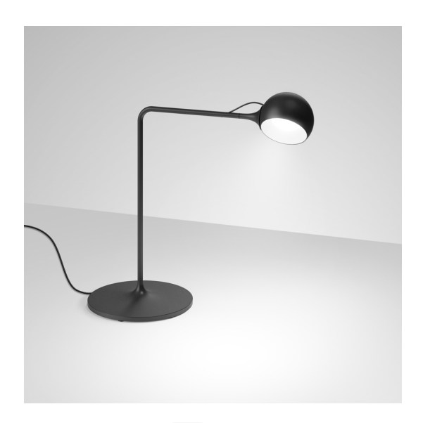
IP 20 ( € Dimmbar: + 0 -