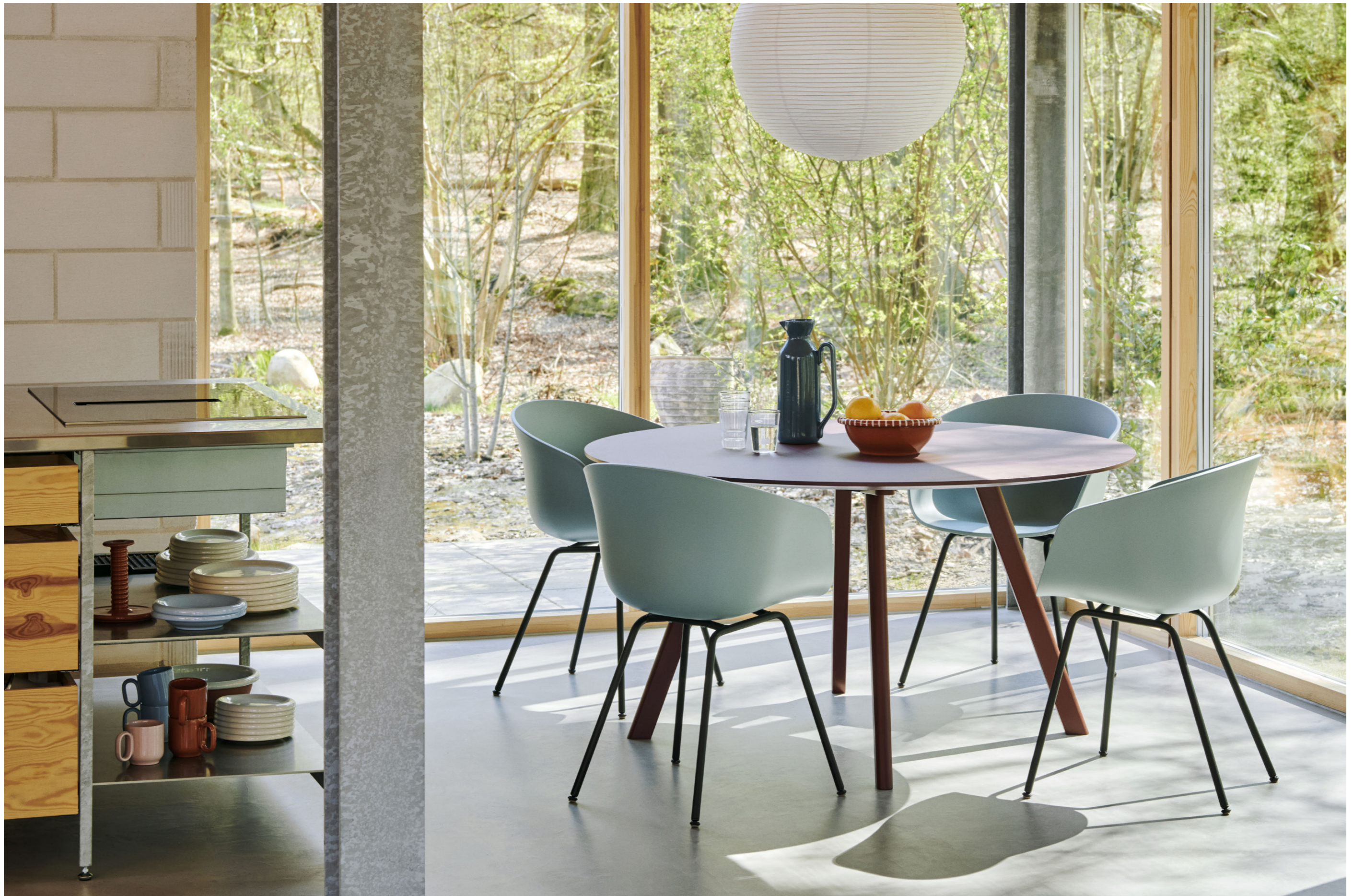
CPH 25 Table Ø140 | Burgundy linoluem tabletop | Bordeaux oak frame