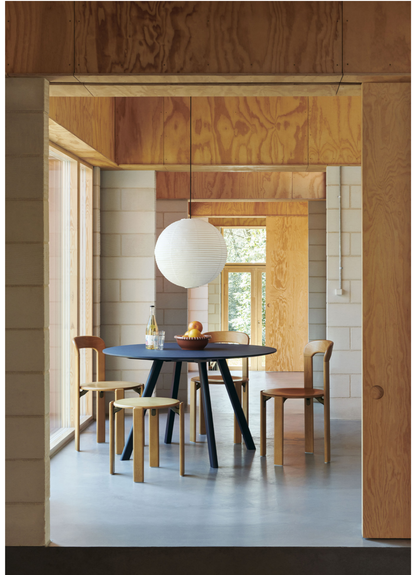
CPH 25 Table Ø120 | Smokey blue linoleum tabletop | Deep blue oak frame

Sharing the same characteristic angled legs as the rest of the Bouroullec brothers' Copenhagen range, the CPH25 table features a round tabletop that softens the engineered expression. The four-legged table frames and tabletops are available in a variety of wood types, materials, and colours, with the possibility to select matching or contrasting combinations. Equally suitable for intimate meetings and larger, café-like environments, this versatile table has an ability to blend into private homes as well as public spaces.