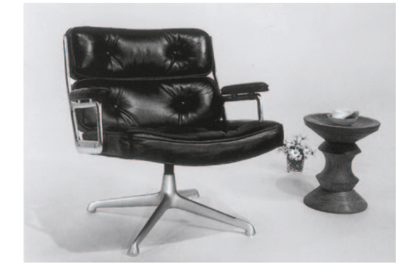
The Lobby Chair was designed by Charles and Ray Eames in 1960 for the lobby of the Time-Life Building in New York. It is an executive chair for offices, conference rooms and waiting areas. Its soft leather upholstery gives it the comfortable feel of a club armchair.