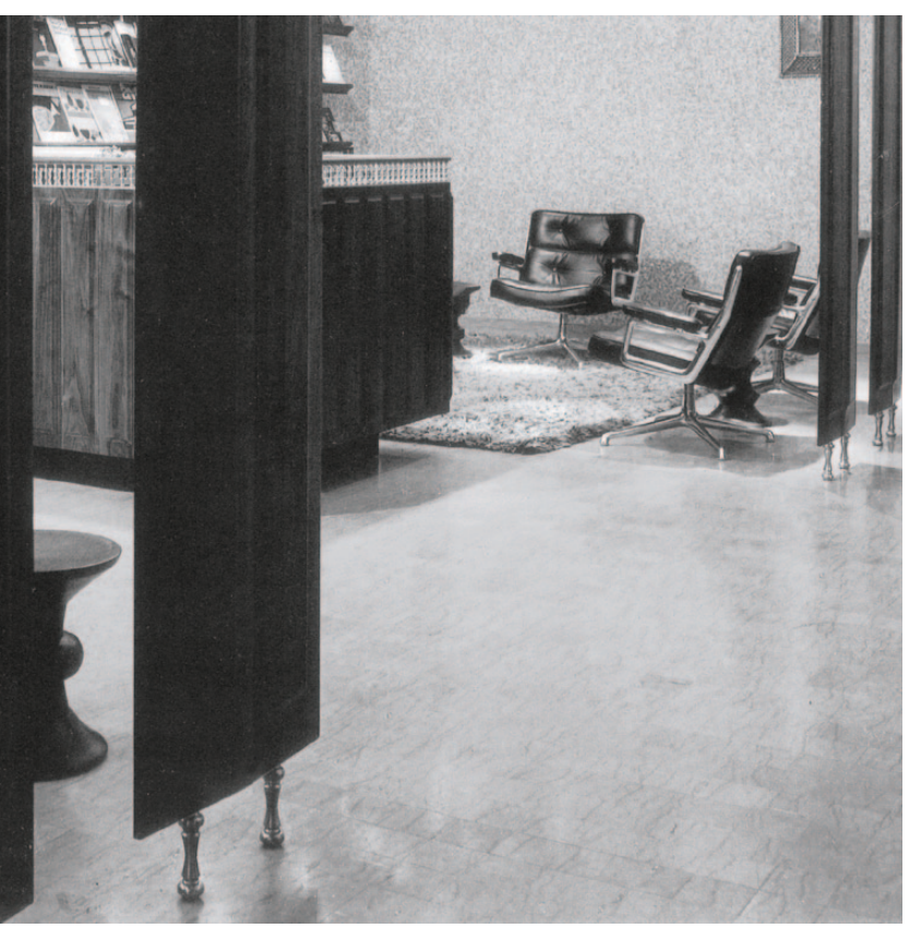
Reception area of the Time-Life Building in the Rockefeller Center, New York, 1960