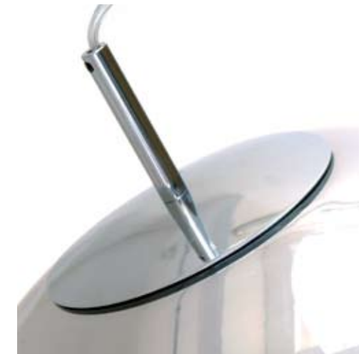
Right: Mirror Ball Floor version on a stand Below: Mirror Balls Detail