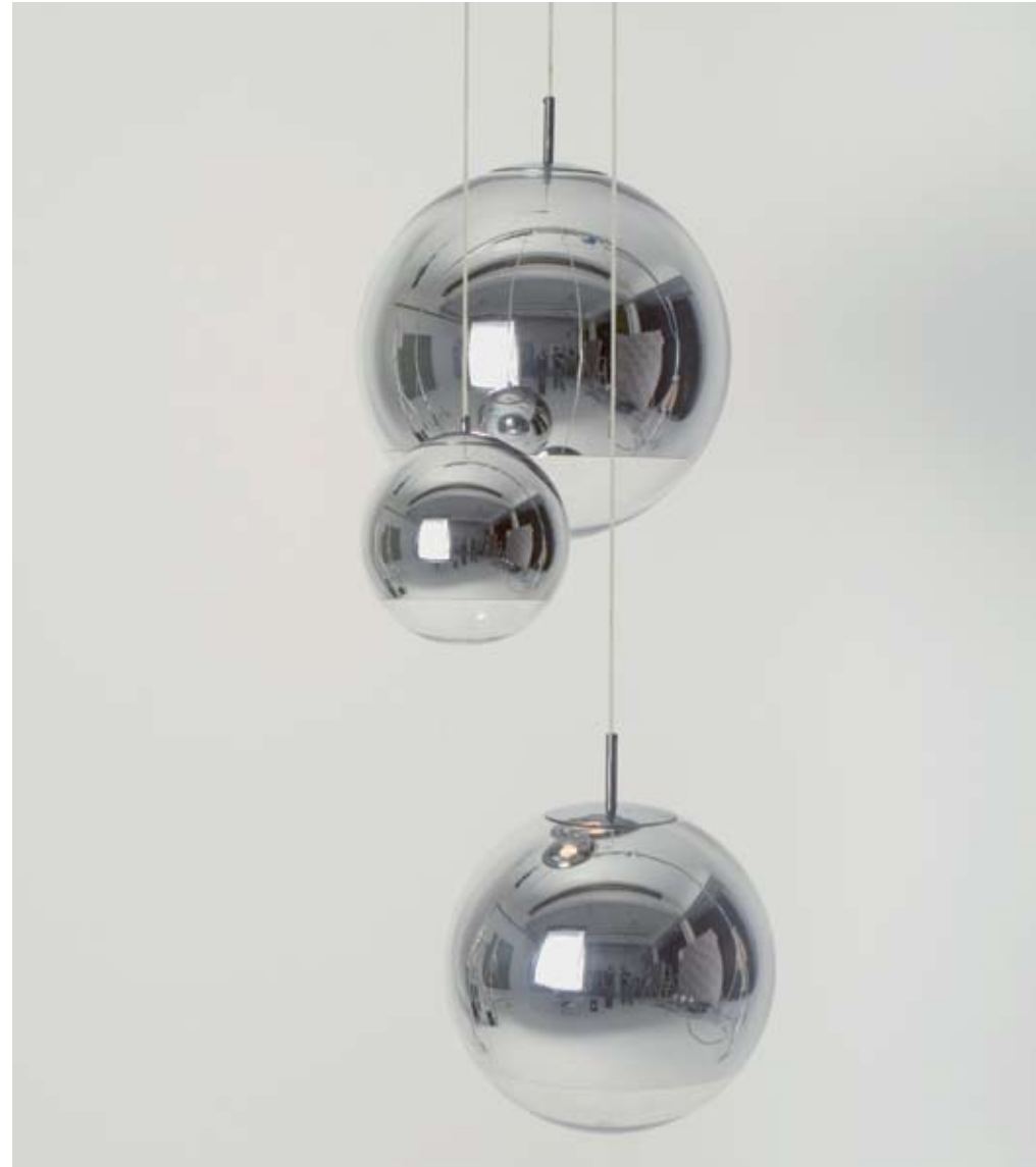
Below: Mirror Ball group