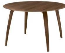
// Walnut nature