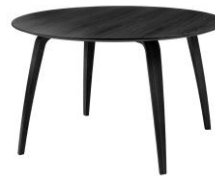
// Black stained ash