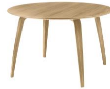
// Oak nature